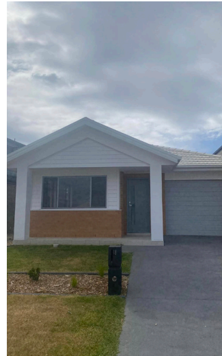
Jermaine & Zemic

Built a $2.4 million portfolio in 3 moves.